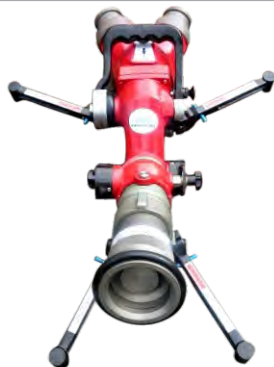
DOUBLE INLET PORTABLE WATER MONITOR