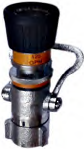
FLOW CONTROL NOZZLE