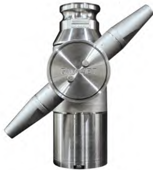
TANK CLEANING NOZZLE