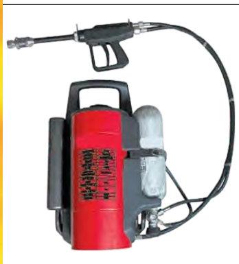
BACKPACK WATER MIST FIRE EXTINGUISHER