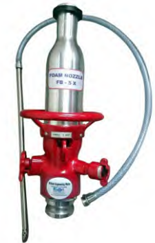
FOAM MAKING BRANCH PIPE FB-5X