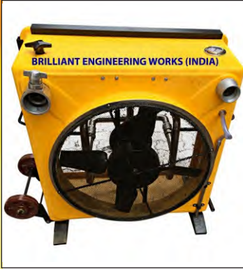
HIGH EXPANSION FOAM GENERATOR