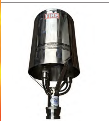
FOAM POURER (S.S.)