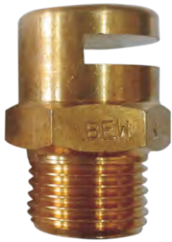
WATER SPRAY CURTAIN NOZZLE