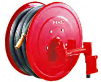
HOSE REEL DRUM 30 METER