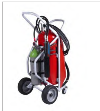
TROLLEY MOUNTED WATER MIST SYTEM