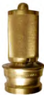
NAVY TYPE NOZZLE