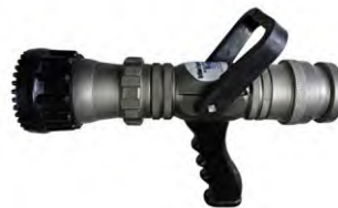
SELECTABLE FLOW CONTROL NOZZLE