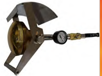
IPX3 / IPX4 SPRAY NOZZLE