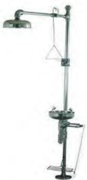
EYE WASH & SHOWER UNIT