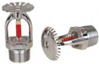
WATER SPRINKLER WITH BULB