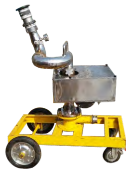
PORTABLE OSCILLATING WATER MONITOR