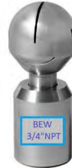
TANK CLEANING NOZZLE