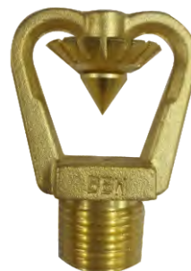
MEDIUM VELOCITY SPRAY NOZZLE