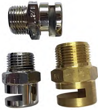
TANK COOLING NOZZLE