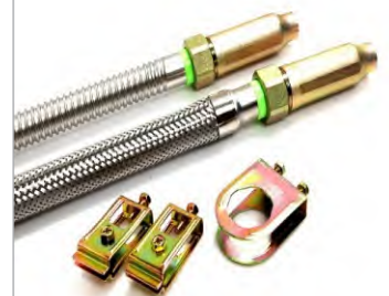
FLEXIBLE SPRINKLER HOSE