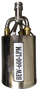
FOAM BUND POURER 600, 400 LPM