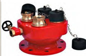
FOUR WAY INLET BREACHING