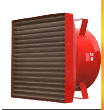
HIGH QUALITY FOAM GENERATOR