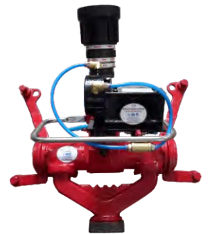
LIGHT WEIGHT PORTABLE OSCILLATING WATER