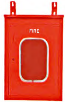
SINGLE HOSE BOX