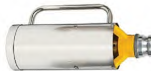
MEDIUM EXPANSION FOAM GENERATOR 250, 450 LPM