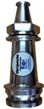
SHORT BRANCH PIPE