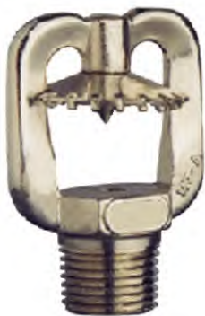
WATER SPRINKLER UPRIGHT