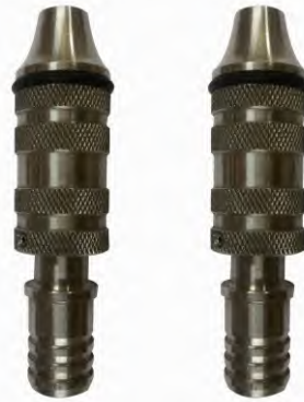
HOSE REEL NOZZLE (SS)