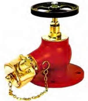
TURN DOWN HYDRANT VALVE