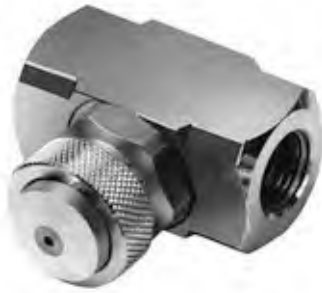
AIR ATOMIZING NOZZLE