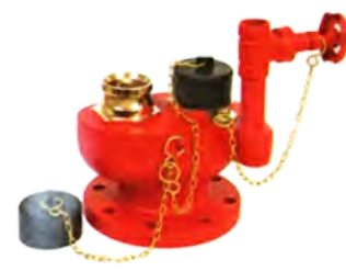
TWO WAY BREACHING