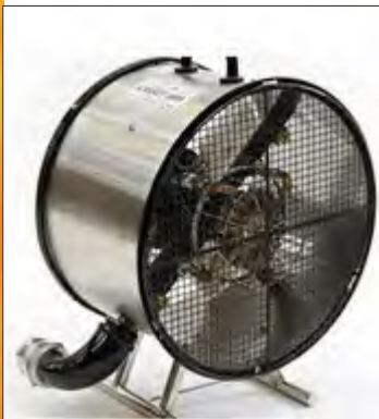
HIGH EXPANSION FOAM GENERATOR