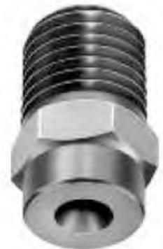
FULL CONE NOZZLE