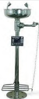
EYE & FACE WASH UNIT