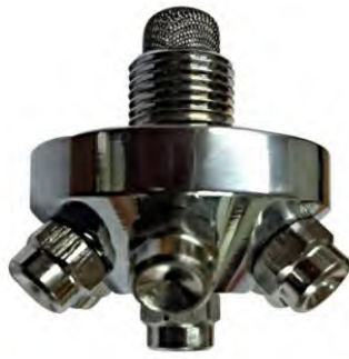
MULTI MIST NOZZLE