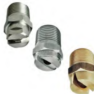
FLAT JET NOZZLE