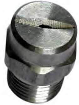
FLAT JET NOZZLE