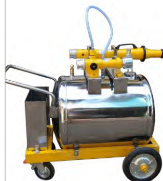
MOBILE FOAM TROLLY(S.S.)