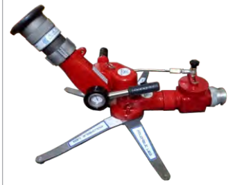
SELF OSCILLATING WATER MONITOR