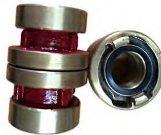
STORZ COUPLING G.M.