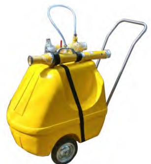
MOBILE FOAM UNIT (FRP)