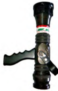
AUTO PRESSURE JET SPRAY NOZZLE