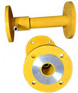
INLINE EDUCTOR (SMALL SIZE)