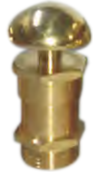
AIR RELEASE VALVE