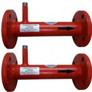
MILD STEEL INLINE FOAM INDUCTOR