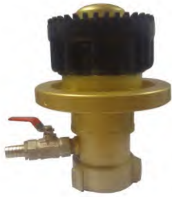
AQUA FOAM NOZZLE GUN METAL