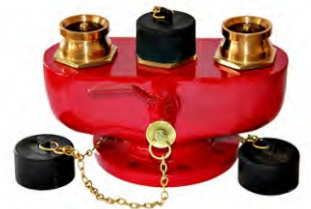
THREE WAY INLET BREACHING