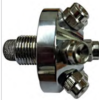
WATER MIST NOZZLE