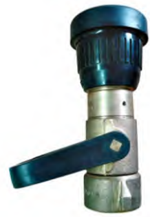
JET SPRAY NOZZLE