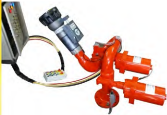
REMOTE CONTROL MONITOR