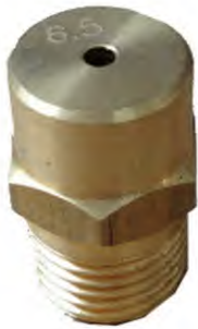
SOLID JET NOZZLE