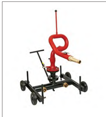
TRAILER MOUNTED MONITOR