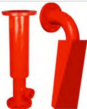
FOAM POURER FOR FOAM MAKER