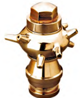
REVOLVING SPRAY NOZZLE