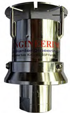
FOAM SPRINKLER FEMALE