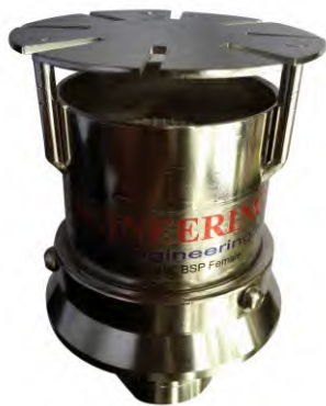
FOAM SPRINKLER MALE