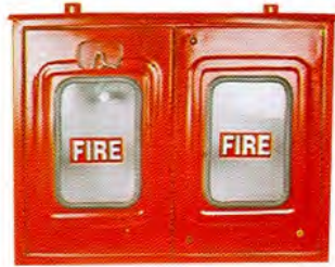
MS HOSE BOX