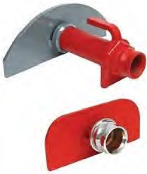
MAYURA JUMBO WATER CURTAIN NOZZLE