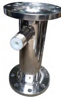
STAINLESS STEEL INLINE FOAM INDUCTOR