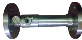
INDUCTOR - SS