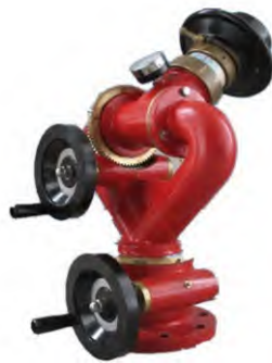
STAND POST MONITOR (S.S.)