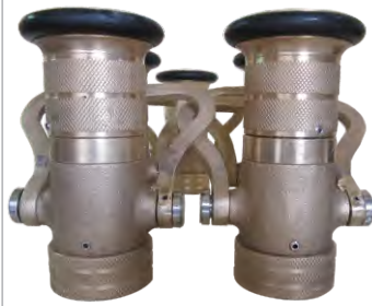
NAVY TYPE NOZZLE