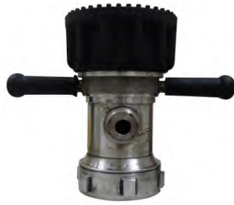
AQUA FOAM NOZZLE STAINLESS STEEL