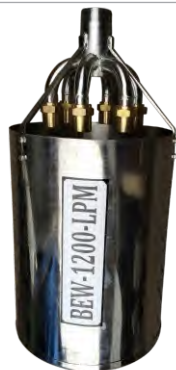
FOAM BUND POURER 1200, 1800 LPM