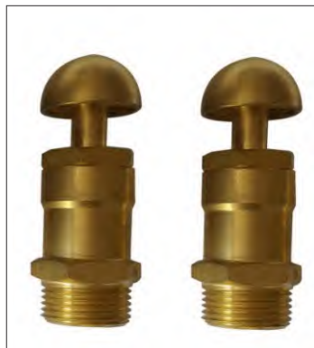
AIR RELEASE VALVES