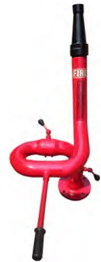
STAND POST TYPE WATER MONITOR