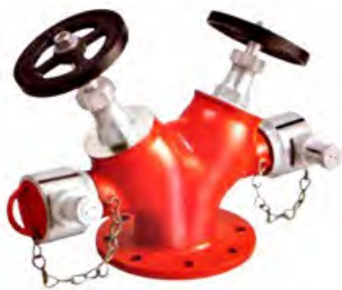
STEEL DOUBLE HEADED HYDRANT VALVE