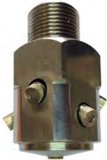
HIGH PRESSURE MULTI MIST NOZZLE