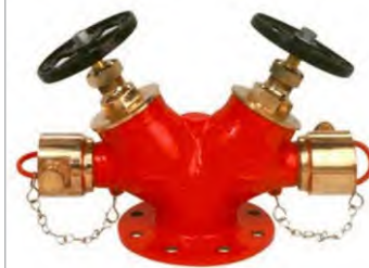
DOUBLE HEADED HYDRANT VALVE