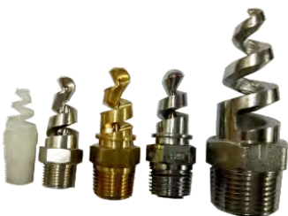
FULL CONE NOZZLE