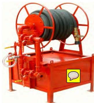
HOSE REEL TANK ASSEMBLY