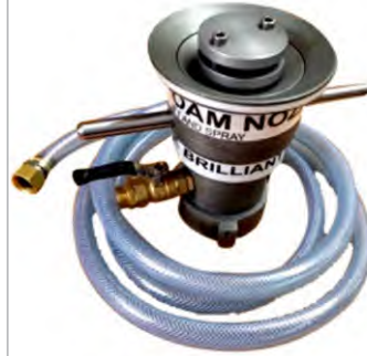
AQUA FOAM NOZZLE ALLUMINIUM ALLOY