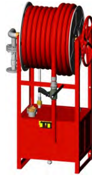
HOSE REEL WITH FOAM TANK ASSEMBLY