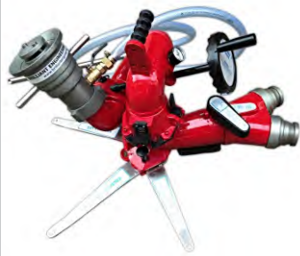
PORTABLE FOAM MONITOR