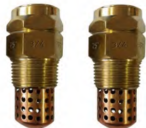
HIGH VELOCITY WATER SPRAY NOZZLE