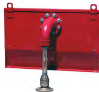
RIMSEAL FOAM POURER