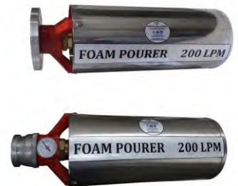
MEDIUM EXPANSION FOAM POURER