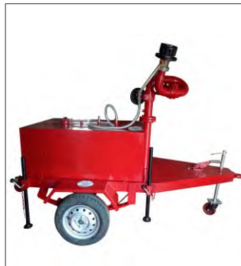
TRAILER MOUNTED WATER CUM FOAM MONITOR