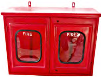
FRP HOSE BOX