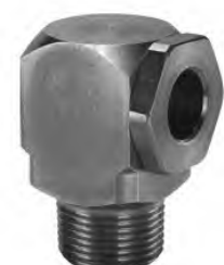
HOLLOW CONE SPRAY NOZZLE