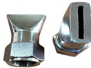
FLAT JET NOZZLE