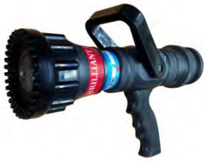
FAST ACTION NOZZLE