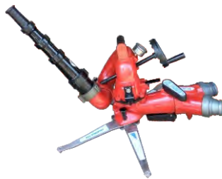
PORTABLE GROUND WATER MONITOR