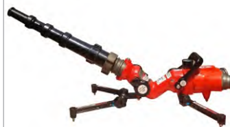
PORTABLE WATER MONITOR