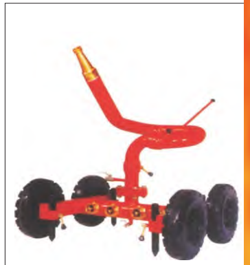
TRAILER TYPE WATER MONITOR