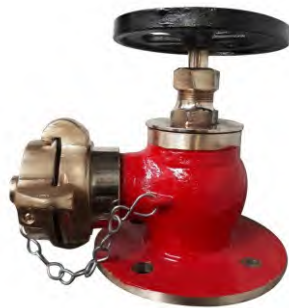
MARINE BRONZE HYDRANT VALVE