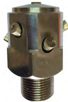
FIRE MIST NOZZLE