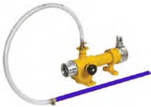
INLINE INDUCTOR (INLINE FOAM INDUCTOR)