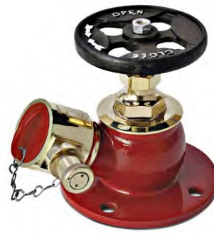
SINGLE HEADED HYDRANT VALVE