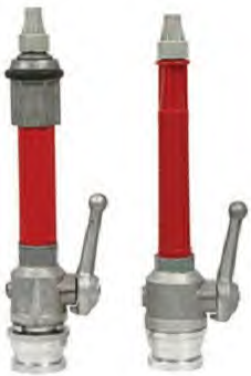
HAND CONTROLLED BRANCH PIPE