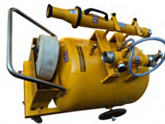
Mobile Foam Unit Mild Steel Trolley