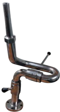
STAND POST MONITOR (S.S.)