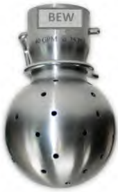
TANK CLEANING NOZZLE