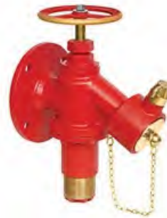
PRESSURE REDUCING WALL