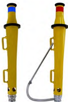
FOAM BRANCH FB-2, FB-10, FB-20