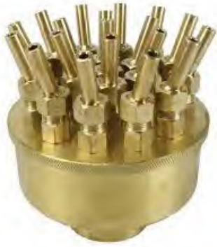
ADJUSTABLE FOUNTAIN NOZZLE