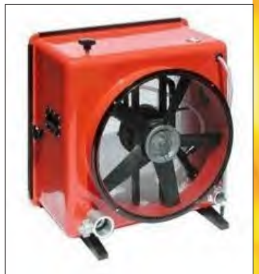
HIGH EXPANSION FOAM GENERATOR