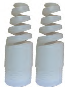
PP SPIRAL NOZZLE