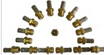
LOW PRESSURE MIST NOZZLE