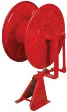
SWINGING TYPE HOSE REEL