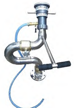
STAINLESS STEEL FOAM MONITOR