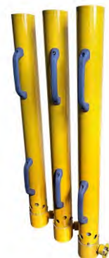
FOAM BAREL FOR MONITOR