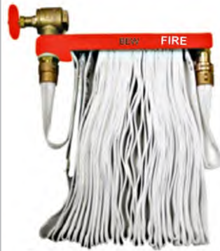
HOSE RACK ASSEMBLY