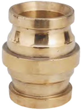
DOUBLE MALE ADAPTER