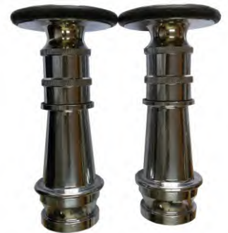
TRIPLE PURPOSE NOZZLE