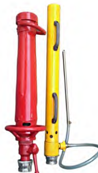
FOAM NOZZLE WITH JET SPRAY AND SHUTT