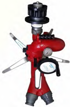
LONG RANGE WATER MONITOR