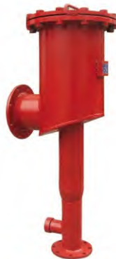
FOAM CHAMBER WITH VAPOUR SEAL