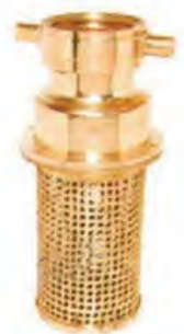
FOOT VALVE STRAINER