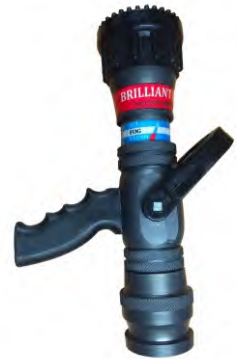
MULTI PURPOSE NOZZLE