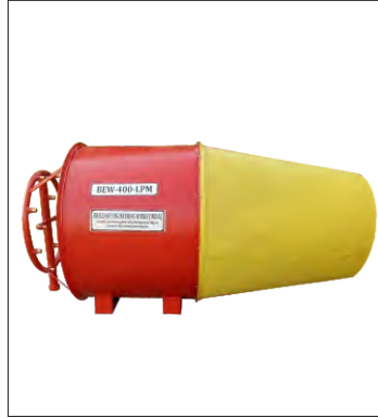
HIGH EXPANSION FOAM GENERATOR 400 LPM