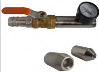
IPX5 / IPX6 JET NOZZLE