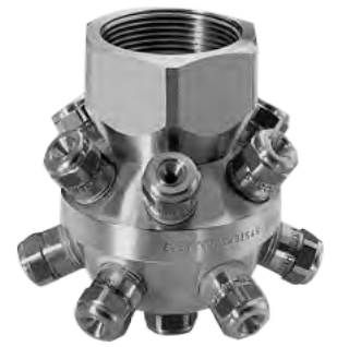
TANK CLEANING NOZZLE