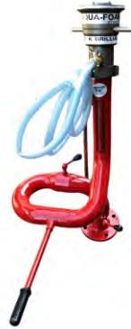
STAND POST FOAM MONITOR